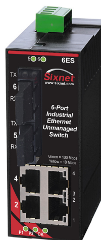
SL-6ES-4/5 Lexan Case Standard Temperature