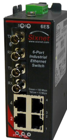
SLX-6ES-4/5 Aluminum Case Wide Temperature

We have been designing industrial hardware such as Remote Terminal Units for over 30+ years and have used this expertise to design the toughest Ethernet switches on the market. Don't trust your critical communications to so-called industrial hardware from commercial switch manufacturers. Sixnet switches give you proven assurance that your system will keep running for years to come.